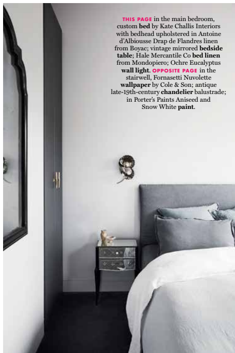
THIS PAGE in the main bedroom, custom bed by Kate Challis Interiors with bedhead upholstered in Antoine d'Albousse Drap de Flandres linen from Boyac; vintage mirrored bedside table; Hale Mercantile Co bed linen from Mondopiero; Ocre Eucalyptus wall light. OPPOSITE PAGE in the stairwell, Fornasetti Nuvolette wallpaper by Cole & Son; antique late-19th-century chandelier balustrade; in Porter's Paints Aniseed and Snow White paint.