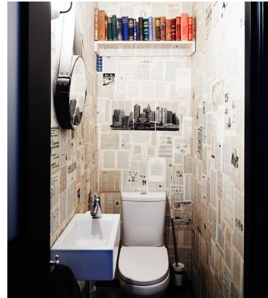
The toilet walls are lined with pages from the books on the shelf.