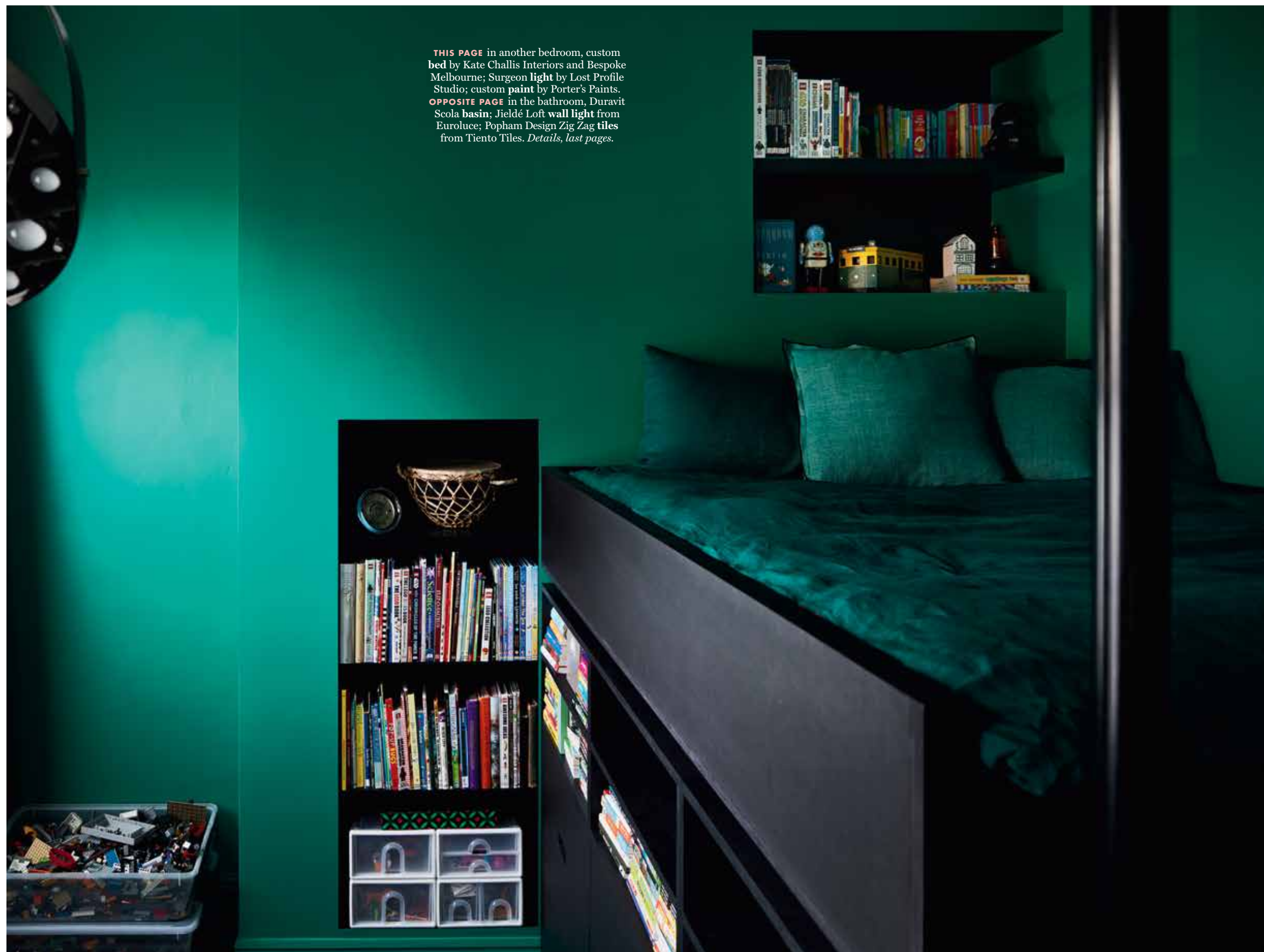
THIS PAGE in another bedroom, custom bed by Kate Challis Interiors and Bespoke Melbourne; Surgeon light by Lost Profile Studio; custom paint by Porter's Paints. OPPOSITE PAGE in the bathroom, Duravit Scola basin; Jieldé Loft wall light from Euro luce; Popham Design Zig Zag tiles from Tiento Tiles. Details, last pages.