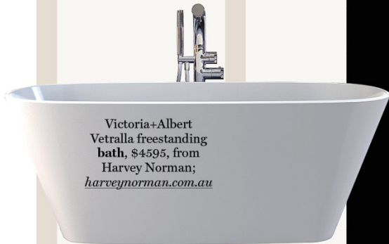
Victoria+Albert Vetralla freestanding bath, $4595, from Harvey Norman; harveynorman.com.au