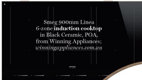
Smeg 900mm Linea 6-zone induction cooktop in Black Ceramic, POA, from Winning Appliances; winningappliances.com.au