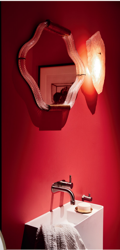
ABOVE Petra II Twin wall sconce, POA, from Christopher Boots; christopherboots.com