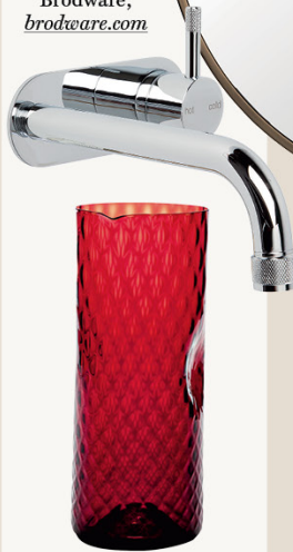
ABOVE Zafferano Veneziano carafe in Red, $125, from Casa e Cucina; casaecucina.com.au RIGHT Lokki hand towel, $30, from Marimekko; marimekko.com